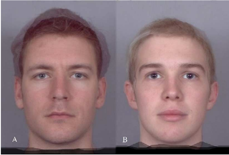
Fig. 1. Composites based on male dominance judgments. (A) comprises the three faces with the highest dominance scores (ranks 1–3), while (B) comprises the three faces with the lowest scores (ranks 64–66). A further four composites were created using faces ranking 6–8, 9–11, 58–60, and 61–63.

were unable to provide a date (or who expressed uncertainty over a provided date) for the onset of their partner's previous or current menses were also omitted. Finally, to ensure that the final sample comprised only participants who had been in a relationship with their current partner for more than 1 month (i.e., been with their partner during a full menstrual cycle), the data of one participant who reported a relationship length of 1 month and the data of nine participants who did not report the length of their current relationship were also omitted. This left a sample of 64 men (mean age=28.58 years; S.D.=8.97). Of the 64, 34 self-reported British nationality, and 59 described their ethnicity as "white". All participants were naïve as to the aims of the current investigation. No rewards were offered for participation.